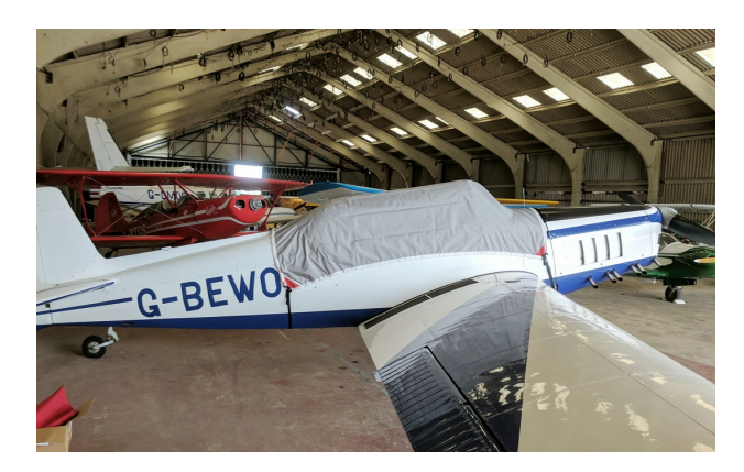
Zlin 326 Travel Cover